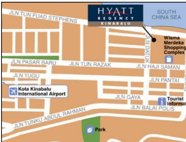
Hyatt Regency Kinabalu

Jalan Dato Salleh Sulong, 88991 Kota Kinabalu, Malaysia