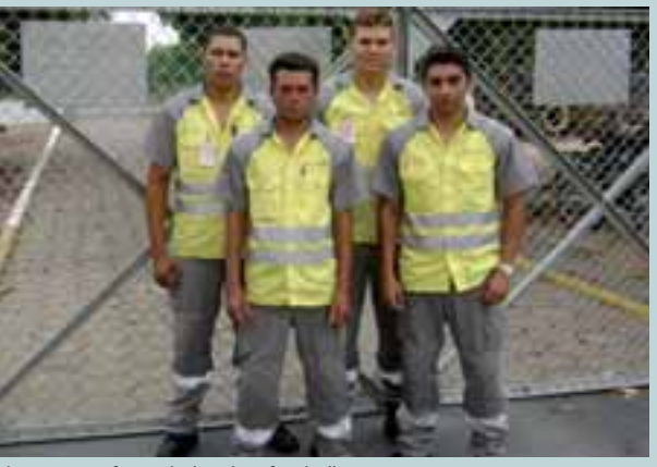
The new uniforms help identify Shell Aviation operators.

The high visibility colours and reflective bands make the operators easy to see at a distance and at night. Other new features include protection for knees and shoulders.